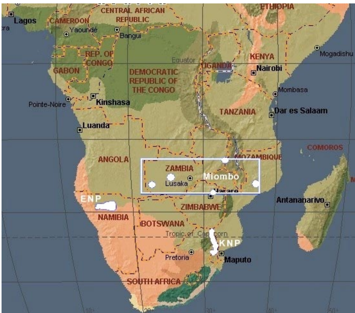
Figure 1: Map of southern Africa showing the main ecological zones and proposed locations for vegetation sampling indicated in white (Etosha National Park, Namibia; Kruger National Park, South Africa; rectangle describes the Miombo Transect region with its five main study sites).

Savannas in southern Africa generally consist of grassy material with some ground litter (partially decomposed bio-material mostly from trees and bushes) and dispersed trees, which compete with grassy material for dominance and can cover between a few and 80% of the area. According to Kelly Kaylor, (University of Virginia, personal communication 1999), woody cover in woodland savannas generally decreases from north to south, with ~80% in northwestern Zambia and ~40% cover in northern Botswana and virtually no trees in arid savanna regions. Grass cover is fairly continuous throughout the region of annual burning. Although much of the biomass found in these ecosystems is burned annually (grasses, small brushes and trees) or used to produce charcoal (wood), the relative amounts of different components that burn vary depending on fuel load, types of woody vegetation, and fire conditions. Juvenile trees may be susceptible to fires and much of the woody litter and all of the grass typically burns annually.